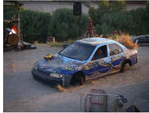
Stage set for the Touch the Water play performed by the Cornerstone Theatre on the River at the Taylor Yard "Bowtie" Parcel