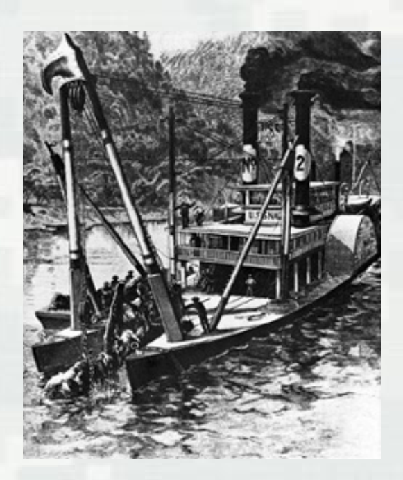
Clearing Snags on the Ohio River circa 1850