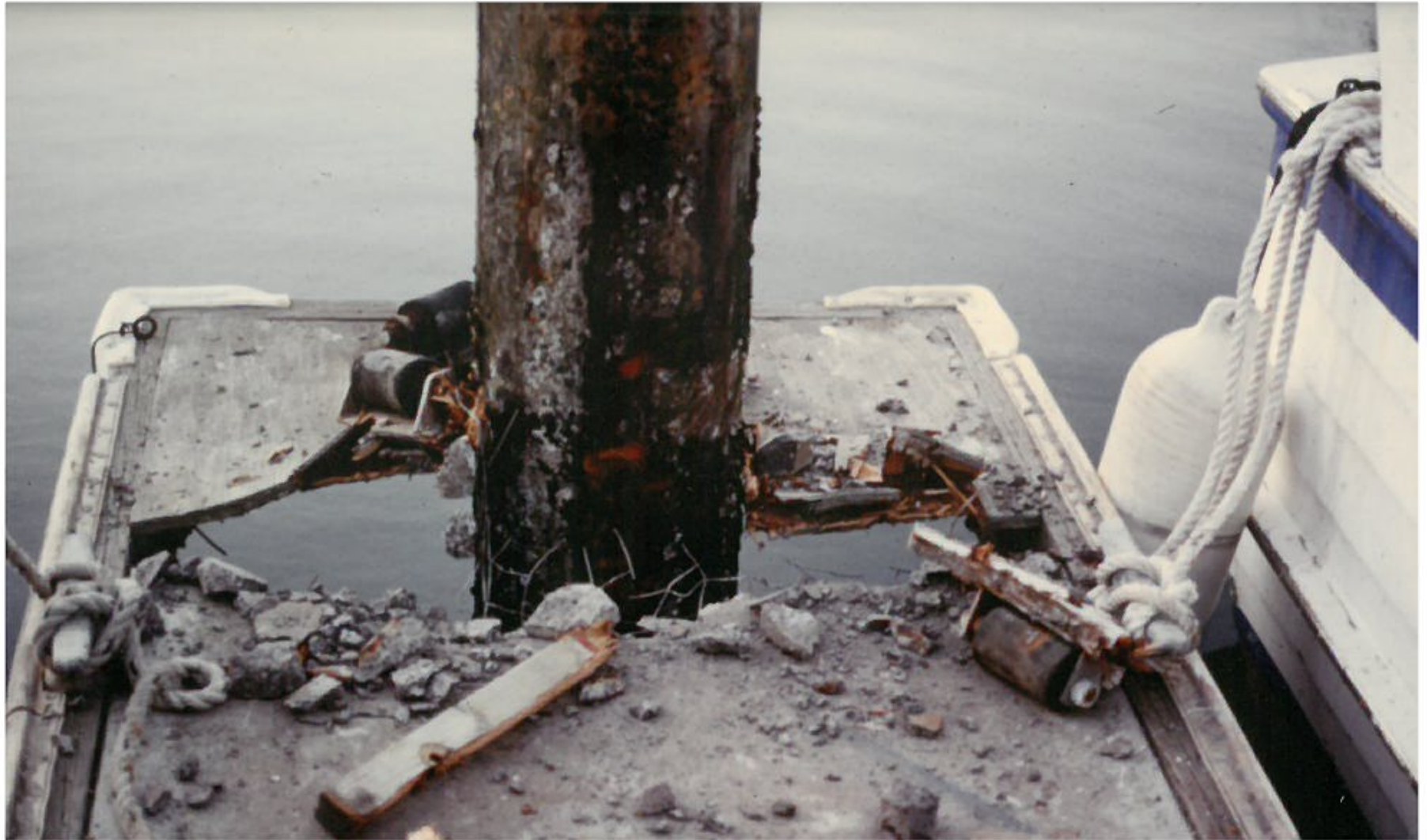
Docks remained in service for another 22 years, until the March 11, 2011, tsunami