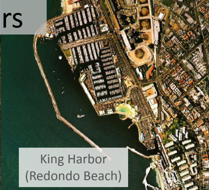
King Harbor (Redondo Beach)