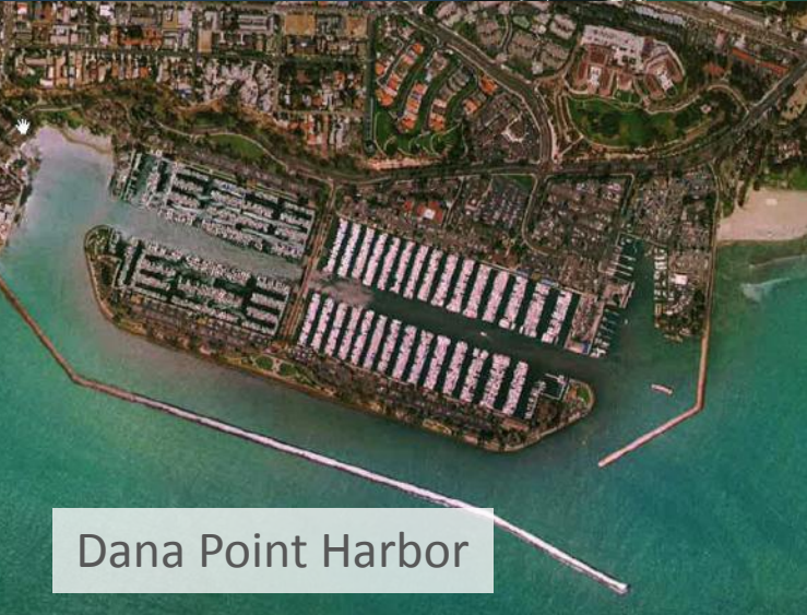
Dana Point Harbor