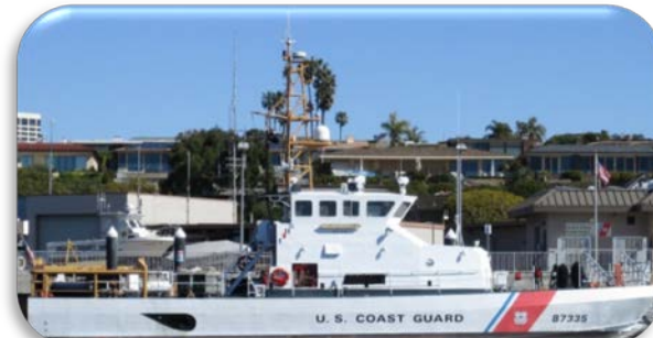
Newport Beach Based Cutter