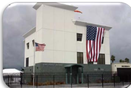
Long Beach Security Center