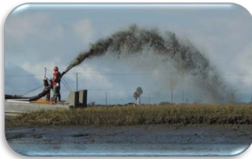
Raising Marsh Elevations