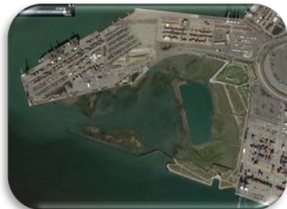
Creating Subtidal Habitat