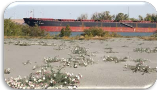
Restoring Endangered Species