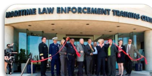
Maritime Law Enforcement Training